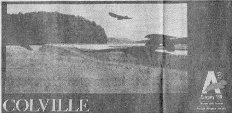
Alex Colville submitted a 1980 painting, Seven Crows